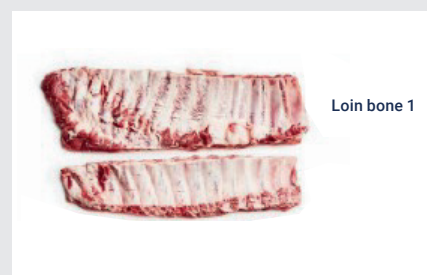
Loin bone 1

Automatic cutting of rib plates which can be divided into 2 : loin rib. The machine is fully flexible so product widths can be adjusted, and one saw can be easily deactivated If only 1 cut is needed.